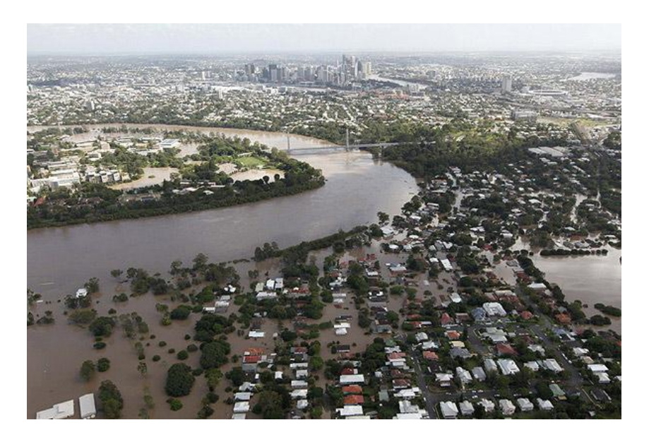
Figure 3: Flooding within Brisbane suburbs in 2011

However, following the flood event, as examined by Raymond (2011), the public perception, driven by media coverage, was that the dam had failed to prevent flooding, without any understanding of the complex interaction between downstream tributaries and the limitations of the existing infrastructure. Managing flooding downstream of Wivenhoe Dam is difficult because the water released from the dam combines with other rivers downstream of the dam. Floodwaters from Lockyer Creek and the Bremer River enter the Brisbane River downstream of Wivenhoe Dam and therefore cannot be controlled by the dam. These downstream rivers alone can cause significant flooding in Ipswich and Brisbane.