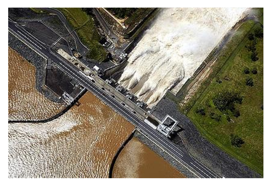
Figure 2: Wivenhoe Dam during 2011 floods

Somerset Dam on the Stanley River and Wivenhoe Dam on the Brisbane River were constructed to provide both urban water supply and flood mitigation. Somerset Dam is located upstream of Wivenhoe Dam. The two dams have a combine storage volume of 1.4 GL used for water supply and over 2.6 GL of temporary flood storage available to provide flood mitigation and to ensure that the dams have adequate flood capacity. The dams are operated to meet a range of flood mitigation objectives including impacts on the rural community, urban flooding and dam safety. Both dams have gated spillways which allow the dam operators to have some control over the discharge from the dam during a flood. The degree of control the dam operators have is dependent upon the and the size and type of the flood event.